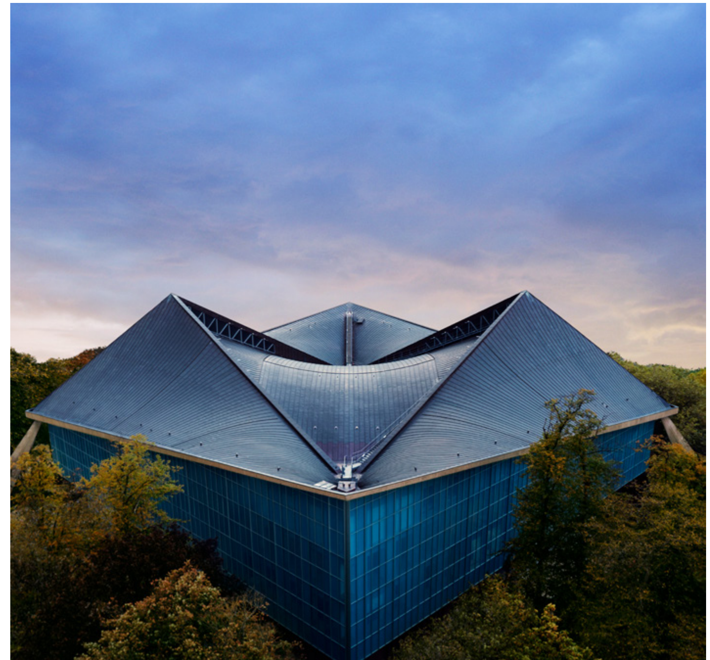
the Design Museum, London