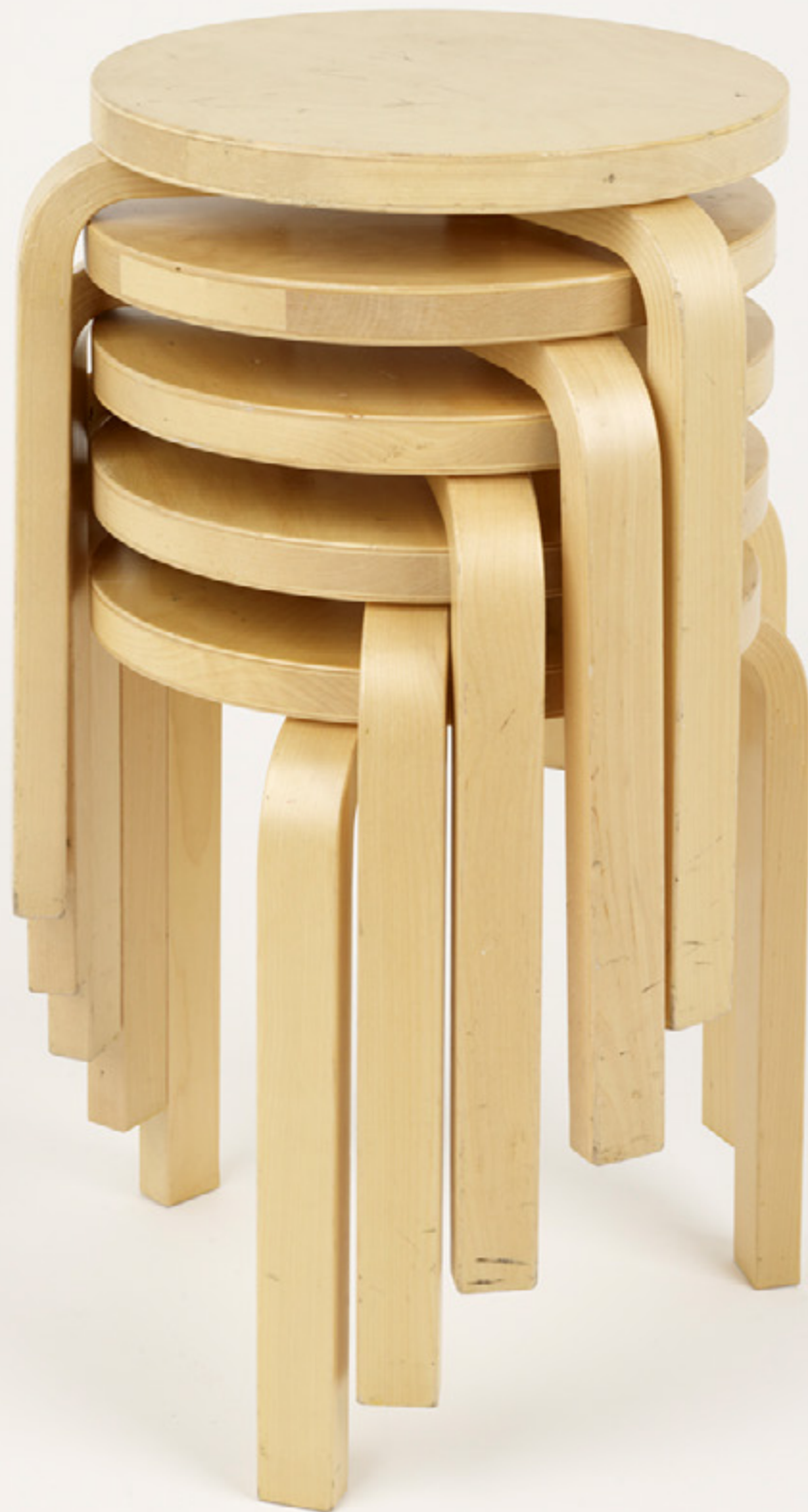
Stool 60, Alvar Aalto