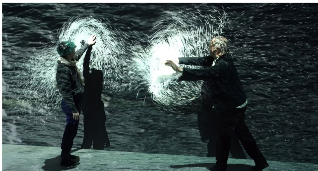
Research images of the installation-experience En amour , December 2023, Crest (FR).