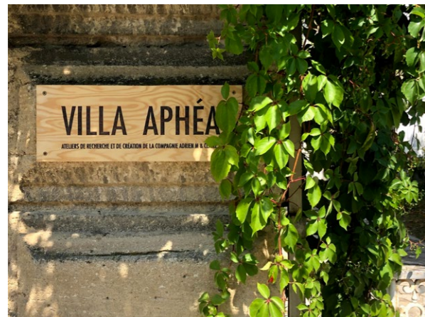
Villa Aphéa, research-creation studio in Crest (FR).