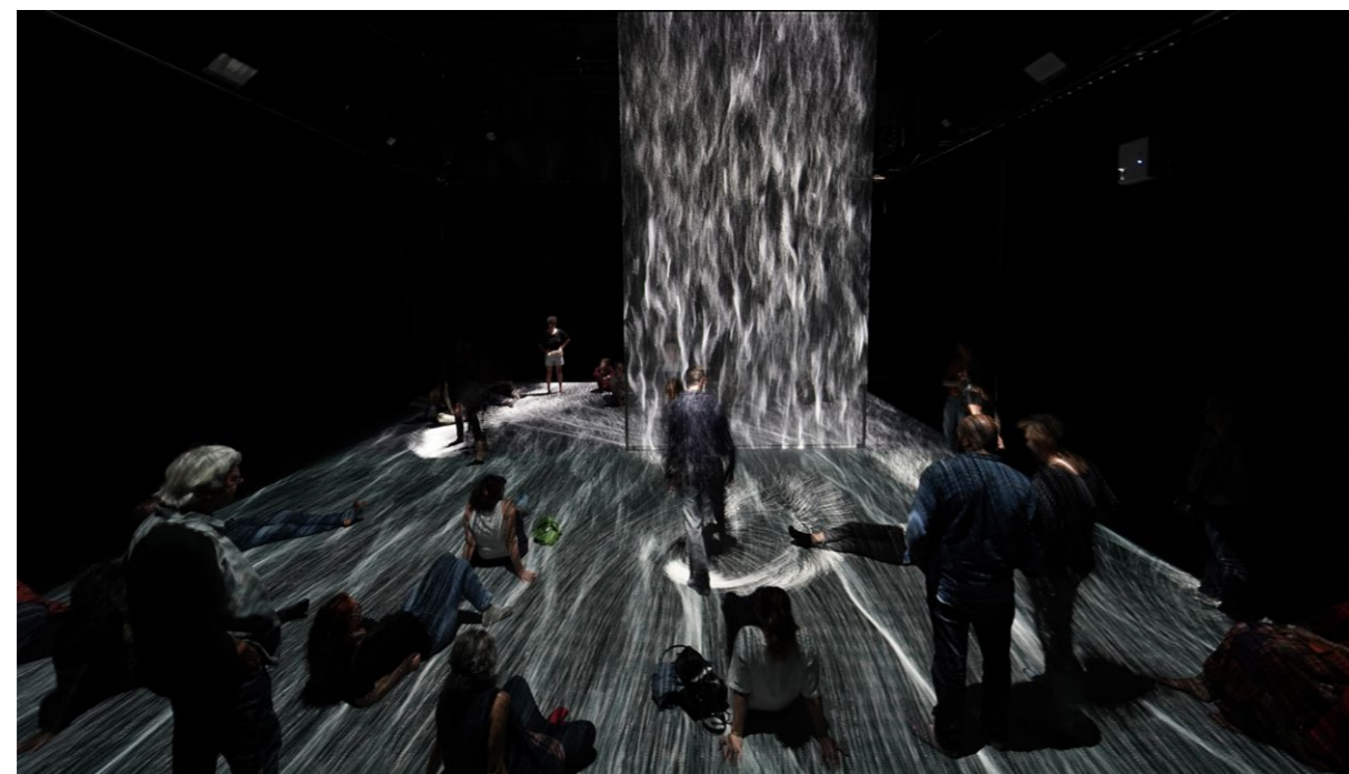
Images of the immersive installation Last minute (2022), first project in the series of Rituals in which En amour (creation 2024) will be a part.