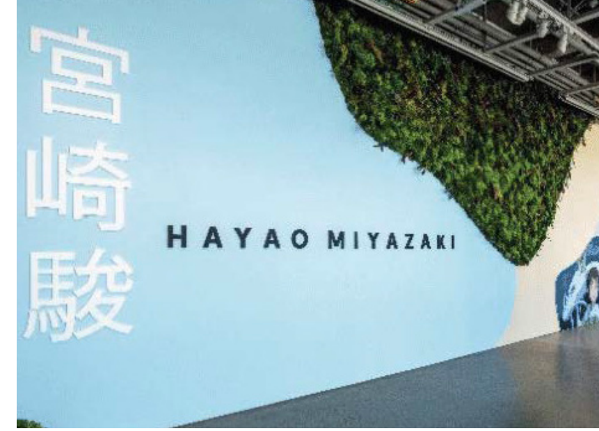
Hayao Miyazaki, 2021

The collecting and preserving of film and film-related material has been ongoing since 1927, resulting in an unparalleled permanent collection that contains more than 13 million photographs, 8.3 million clippings, 95,000 screenplays, 73,500 posters, 145,000 production and costume design drawings, 45,000 sound recordings, 39,000 books, 1,900 special collections, 242,000 film and video assets, and 8,000 props, process, and production items representing motion picture technology, costume design, production design, makeup and hairstyling, visual effects, promotional materials and more.