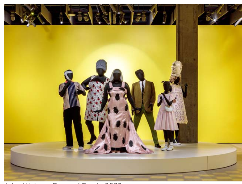
John Waters: Pope of Trash, 2023