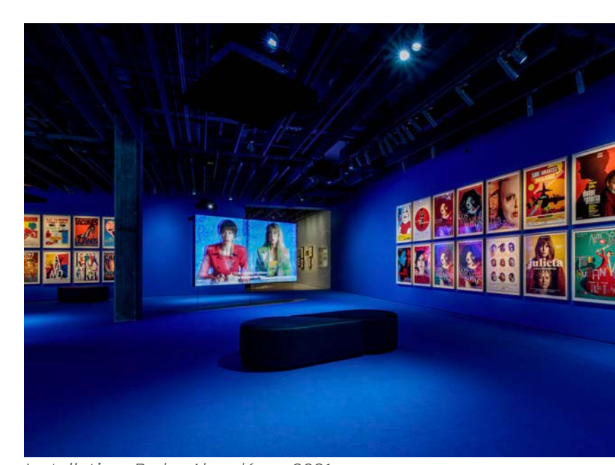
Installation: Pedro Almodóvar, 2021