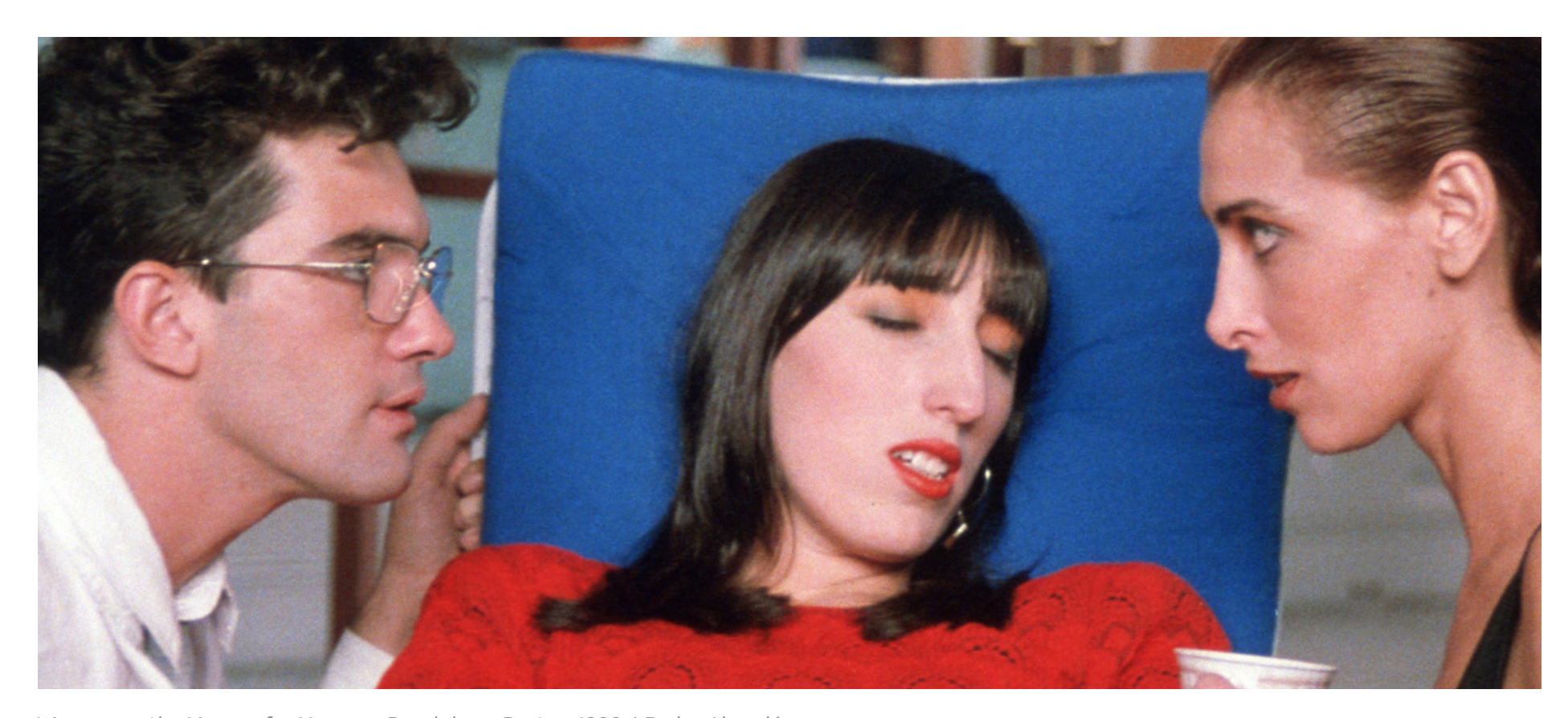
Women on the Verge of a Nervous Breakdown Poster, 1988 / Pedro Almodóvar

The film series will be available to Venues, who will be responsible for licensing the films and any associated fees.