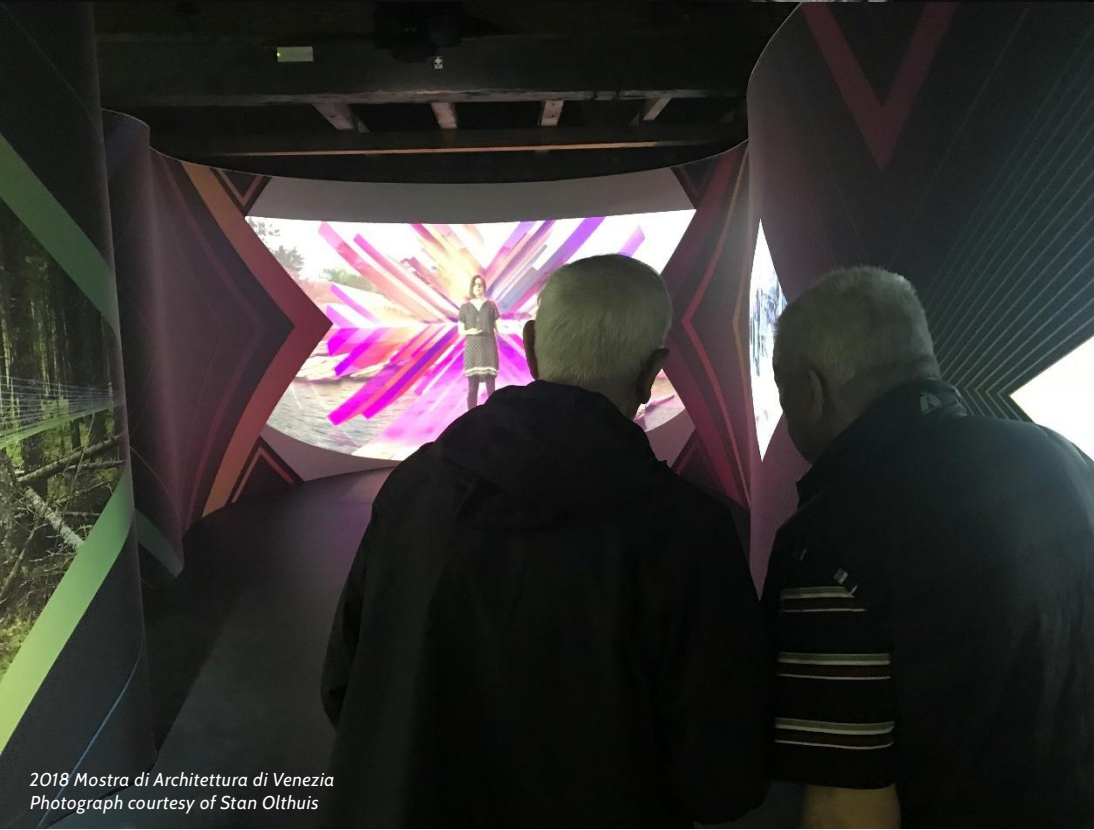
2018 Mostra di Architettura di Venezia

An unprecedented exhibition – Canada’s first official entry to the Venice Biennale Architettura to be presented in its full integrity on Canadian soil